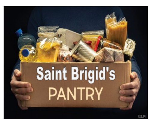
Our donations for July will go to:

Project Rachel—God's Greatest Desire is to Forgive if you have ever had an abortion experience, the Catholic Church wants to reach out to you and offer healing and reconciliation through Project Rachel, a confidential ministry for women and men. For more information, please call our Project Rachel confidential telephone number at: (859) 392-1547.